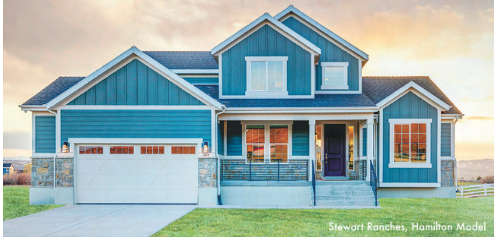
Stewart Ranches, Hamilton Model