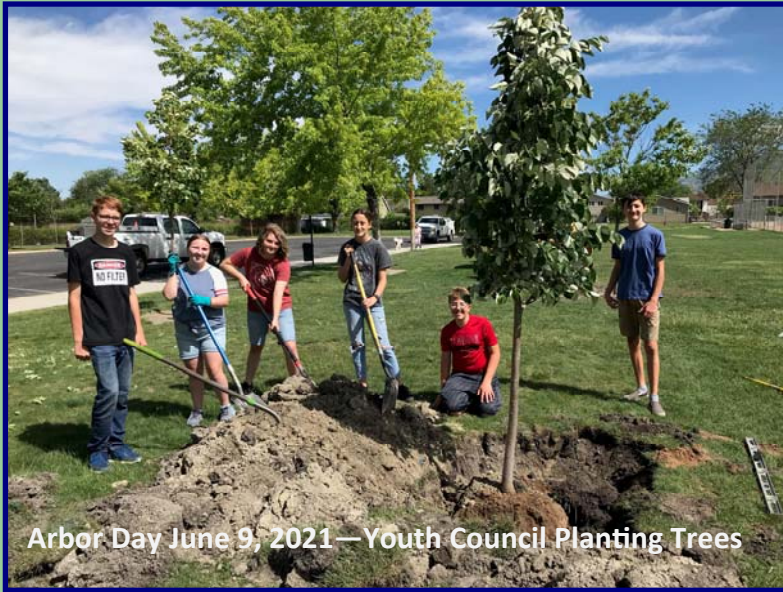
Arbor Day June 9, 2021—Youth Council Planting Trees