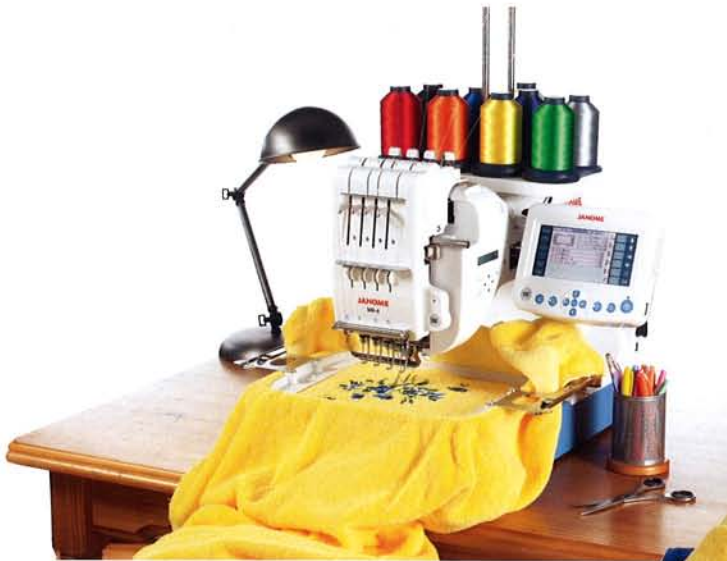
The MB-4 weighs only 45 lbs. Fits a 15"x 21" space