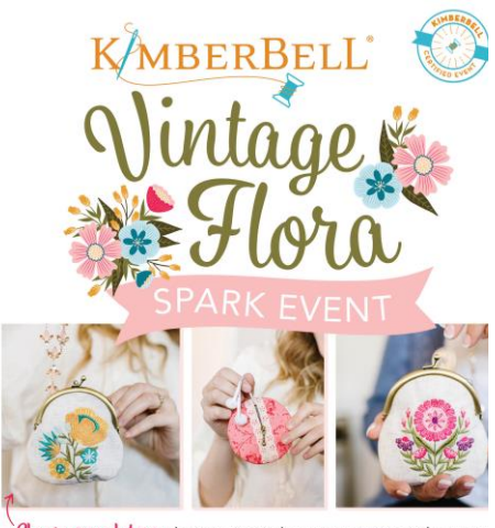
Choose one of two designs to stitch on your purse at the even