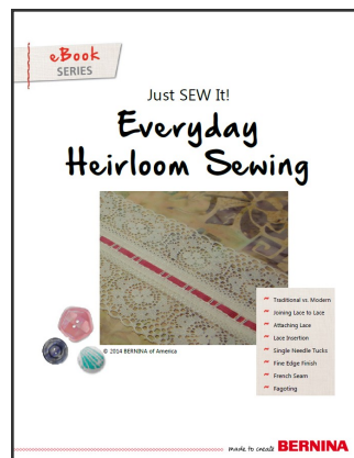
Just SEW It eBook Everyday Heirloom