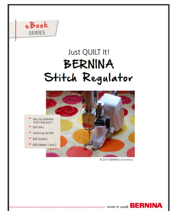
Just QUILT It eBook BSR