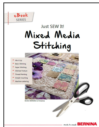
Just SEW It eBook Mixed Media Stitching