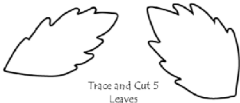
Trace and Cut 5 Leaves