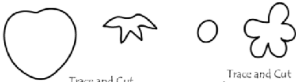
Trace and Cut 8 Berries & 8 Stems