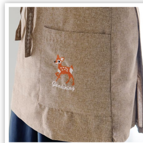
240 BUILT-IN EMBROIDERY DESIGNS