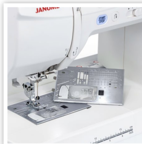
2 NEEDLE PLATES: ZIG ZAG, STRAIGHT STITCH