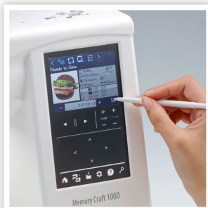
MULTI-LANGUAGE TOUCH SCREEN