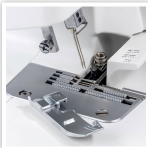
IMPROVED FEED DOGS AND MOTOR TORQUE