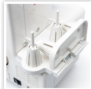
COMPACT DESIGN: FOLDING SPOOL TRAY