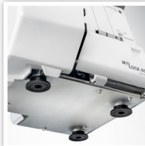
SOLID FOUNDATION: METAL BASE PLATE