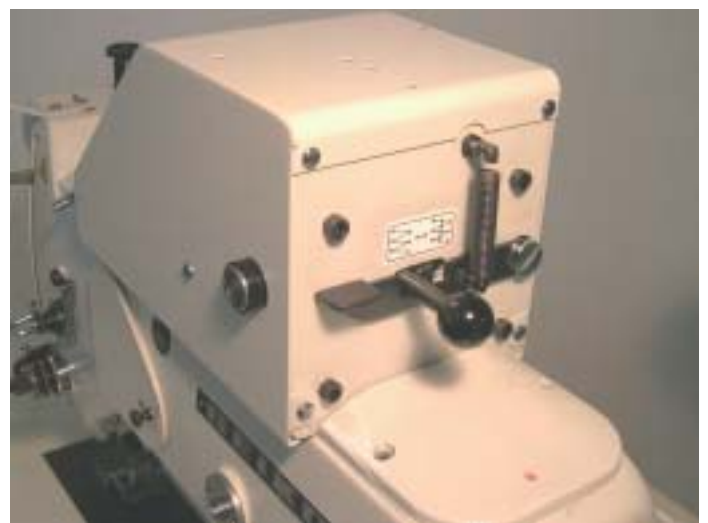
2-point/3-point changing lever