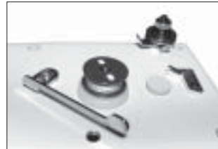
Built-in bobbin winder