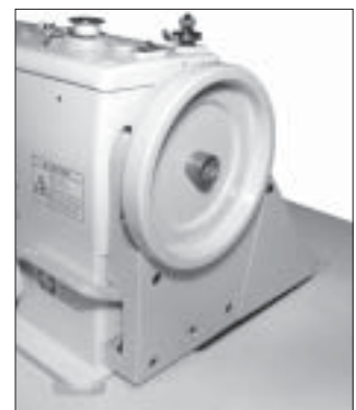
Large pulley (O.D. 150mm)