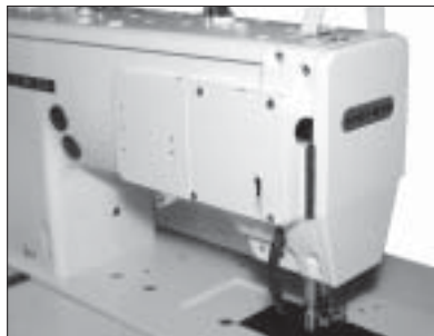
Open/close simplified face plate and upper feed mechanism