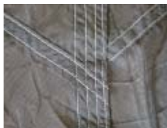
sewn stitch 1/4"-5/16"-1/4"