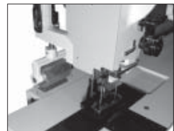
Clutch driven puller feed

30 inch machine arm, large hook, reverse stitch, automatic back tack, foot lifter