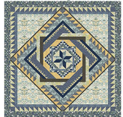
Stars Over the Lake