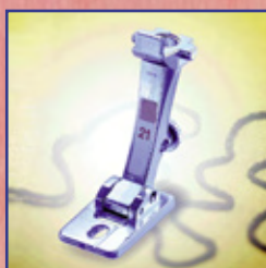
Braiding Foot #21 OR Bulky Overlock Foot #12C