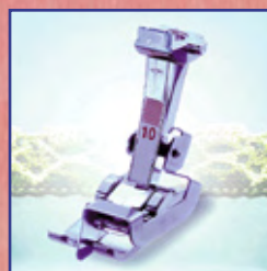
Edgestitch Foot #10/10C