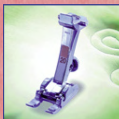
Open Embroidery Foot #20/20C