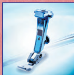
Zipper Foot #4

This collection of presser feet is useful when making the heart projects shown here. For additional information, see Feet-ures, Volumes 1-3, available at your local BERNINA® dealer.