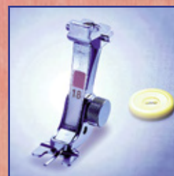
Button Sew-On Foot #18