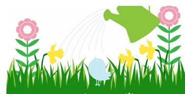
Yard of the Month Entry Form