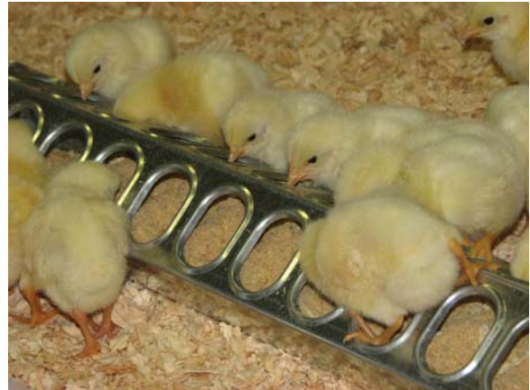
Figure 5. Example of one type of feeder commonly used to start chicks.