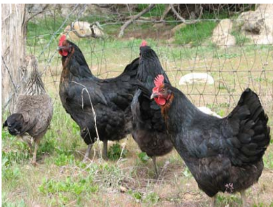
Figure 1. Hens enjoy the spring breeze.

Backyard chicken keeping is increasing in popularity. There are many reasons for this. Perhaps it is to have a ready source of eggs and meat, or as a backyard help in pest control, or perhaps it is just because they are fun to watch. Whatever the reason, chickens can be a great source of enjoyment if properly managed and given appropriate care.