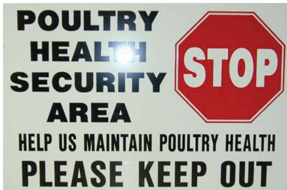
Figure 7. Always think about what you can do to protect your own birds and your neighbor's birds from disease.