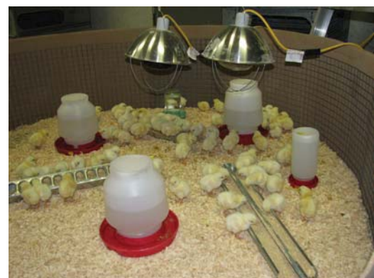
Figure 2. Example of a brooder ring.