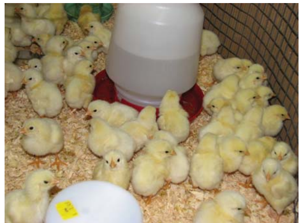
Figure 4. Chicks shown drinking from a 1 gallon fountain-type waterer.

Although types and designs of drinkers vary, the fact that fresh clean water must be present at all times should never be forgotten. Fountain-type drinkers have the advantage of being affordable and easily moved around; however, because the reservoir holds only a finite quantity of water, it is necessary to watch carefully that they don't become empty.