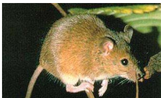
Figure 6. House mouse. Average litter size is six and one female can have up to eight litters per year. Average range is 15 to 30 feet. A mouse can last longer without water than a camel.

Maintain a rodent control program around the poultry house. When building the floor, integrating heavy gauge wire mesh beneath the subflooring is recommended to discourage entrance of predators and other varmints. Cover windows and vent openings with good quality poultry wire to keep out birds. Make sure doors and windows fit tightly. Caulk and seal all cracks and crevices. Small rodents can gain entry through holes the size of a nickel or quarter. Keep the poultry house locked to discourage theft and uninvited visitors.