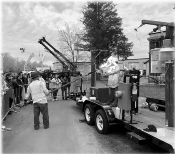
Power Service Center 1455 E Power Plant Rd