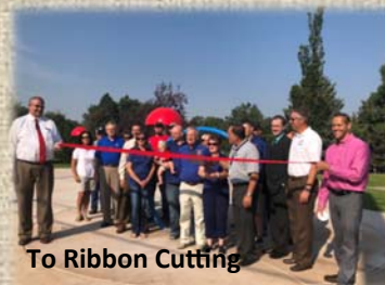
To Ribbon Cutting

Special Thanks to Brigham City Rotary Club & other donors who helped make this project possible.