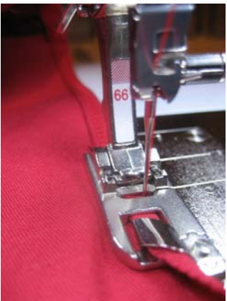
6mm Zigzag Hemmer #66