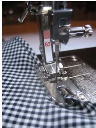
3mm Zigzag Hemmer #63