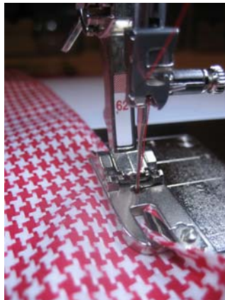
2mm Straight Stitch Hemmer #62