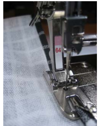
4mm Straight Stitch Hemmer #64