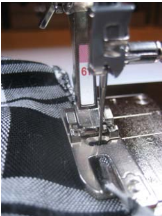
2mm Zigzag Hemmer #61