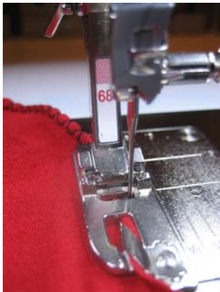
2mm Roll & Shell Hemmer #68