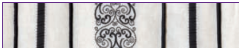
Left to Right: Double-serged Pintuck, Flatlock Stitch with Ribbon, Double-serged Pintuck, Center Embroidery Design, Double-serged Pintuck, Flatlock Stitch with Ribbon, Double-serged Pintuck

The camisole design features embroidery on the front, framed on the right and left with alternating rows of double stitched serger tucks and ribbon woven flatlocking. Rows are positioned 1" apart, measured from the outer left and right sides of the center embroidery on the front. The camisole back does not have center embroidery. Flatlock ribbon weaving is serged at center back, framed by a pair of double stitched tucks, one each on the left and right sides.