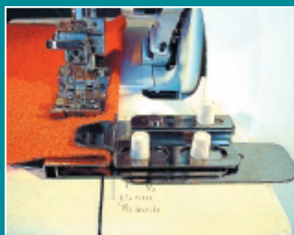
Attach hem guide to bed of serger.