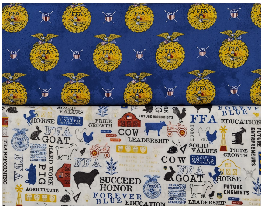
Riley Blake's latest offering of FFA prints