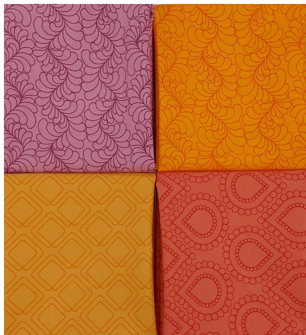
Rainbow Sherbert from Moda