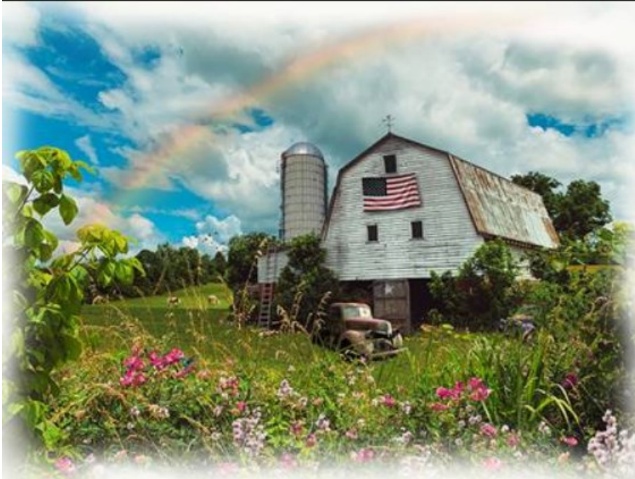
Sun Up to Sun Down Spring panel Fresh from Hoffman Prints