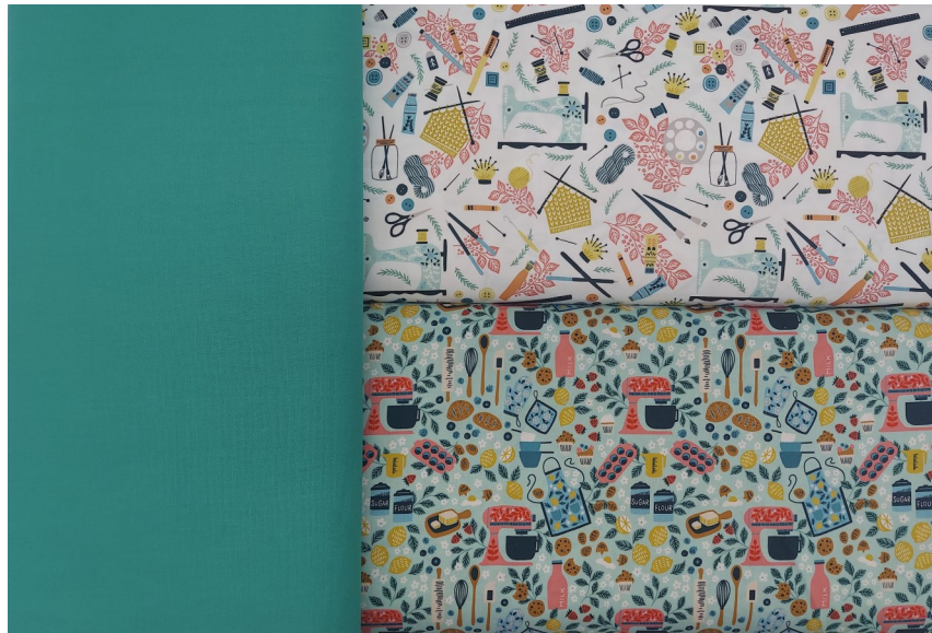
Sunday Afternoon from RJR Fabrics Crafting and baking are some of our favorite Sunday afternoon activities!