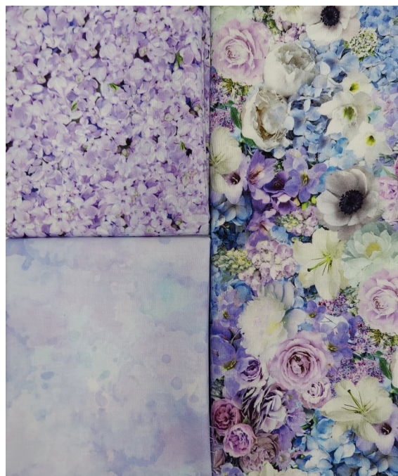
Love Letter from Timeless Treasures