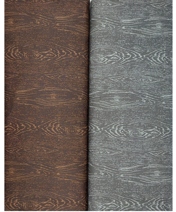
24 7 Wood Grain Also from Hoffman