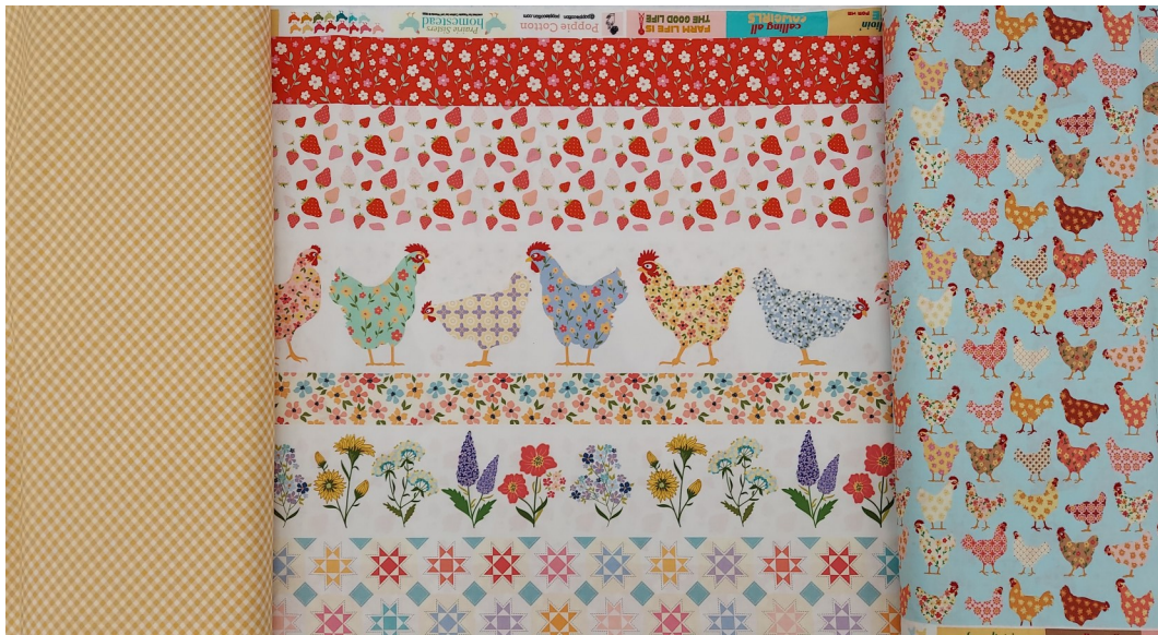
Homestead by Prairie Sisters of Poppie Cotton We can't wait to make an apron out of that border print!