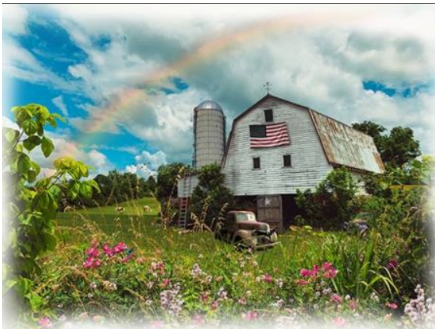
Sun Up to Sun Down Spring New panel in from Hoffman

Pattern by Natalie Gehling of Country Road Quilting!