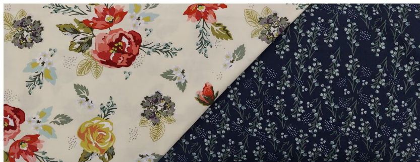
Bellissimo Gardens from Riley Blake Find a coordinating red for a pretty 3 yard quilt!