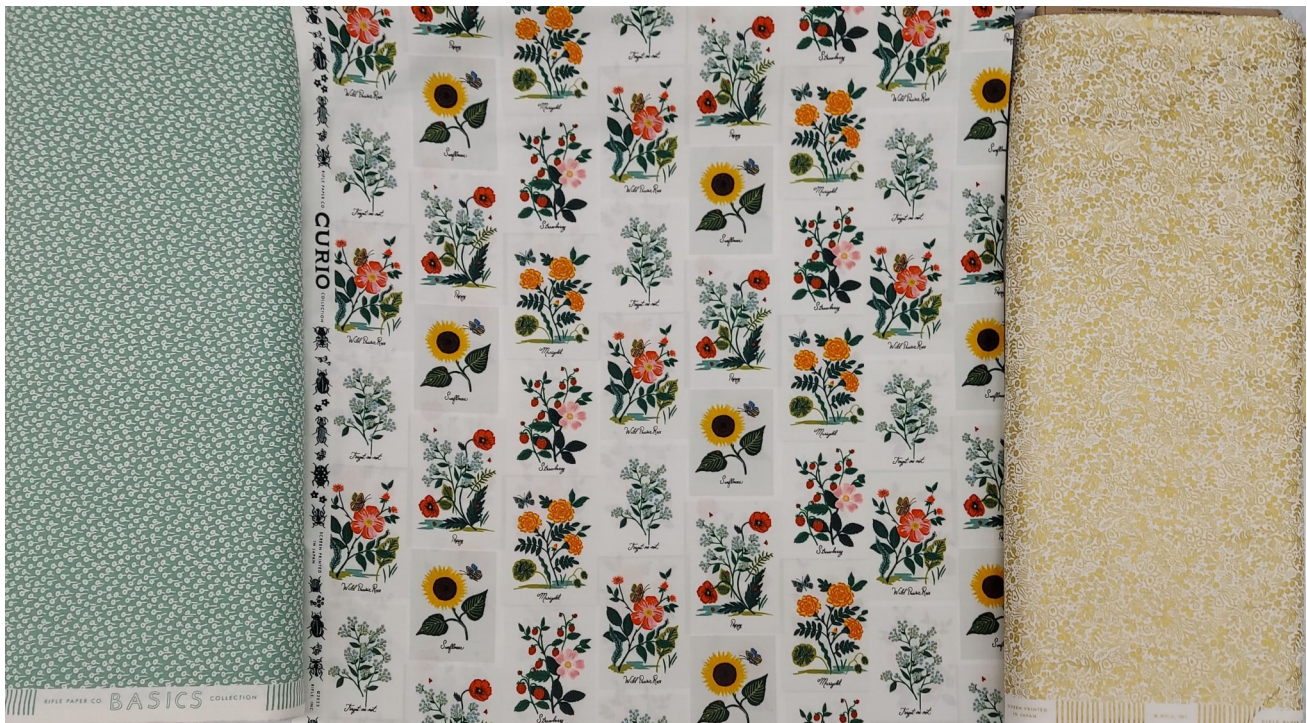
Curio by Rifle Paper Co from RJR