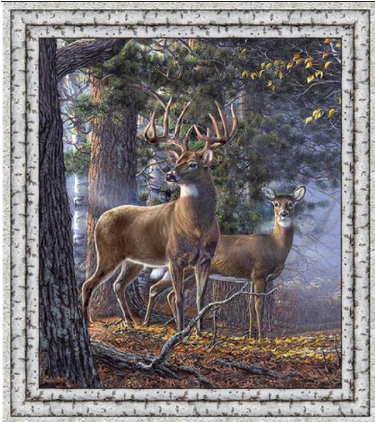
First Light New wildlife panel from Northcott