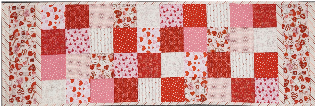
Valentines or St Pat's End to End Table Runner Kits 18x59 Table Runner Kits, including backing!