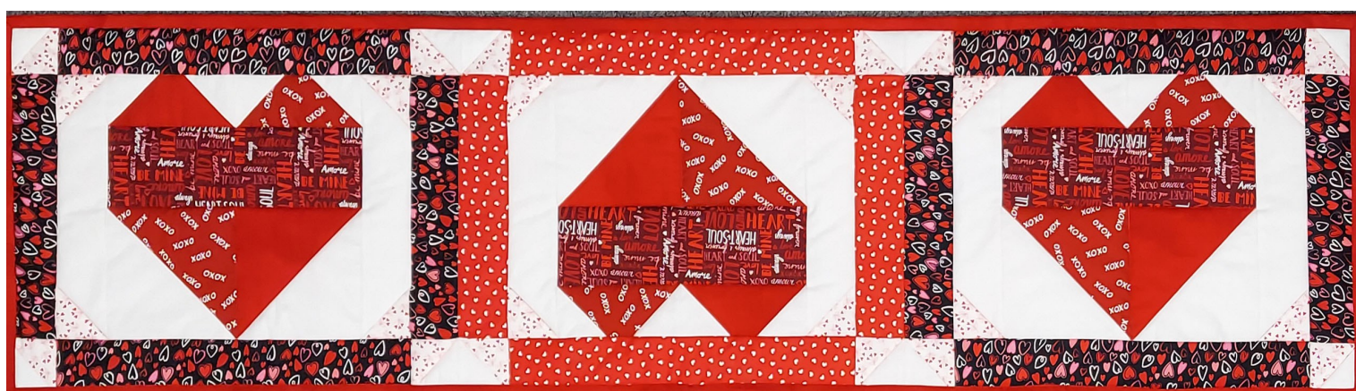
Happy Hearts Table Runner or 4 Placemat Kits 14x54 table runner or 4) 14x18 placemats