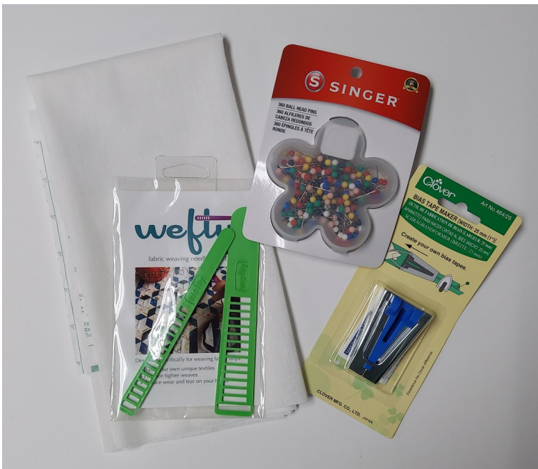
Fabric Weaving Tool Kit

New patterns include Spring on the Farm, Four O'Clock placemats or table runner, and Holiday Lights