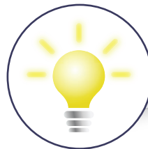
QuiltMaster TM LED lighting: throat, needle, and bobbin