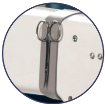
Magnetic tool minder collar