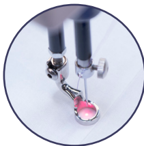
Pinpoint needle laser