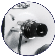
Easy-Set Tension TM