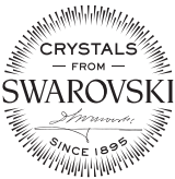
Crystal Edition Inspiration Kit

Visit us online or stop by a store near you to experience the magic. Let your creativity shine at bernina.com/crystal-edition .