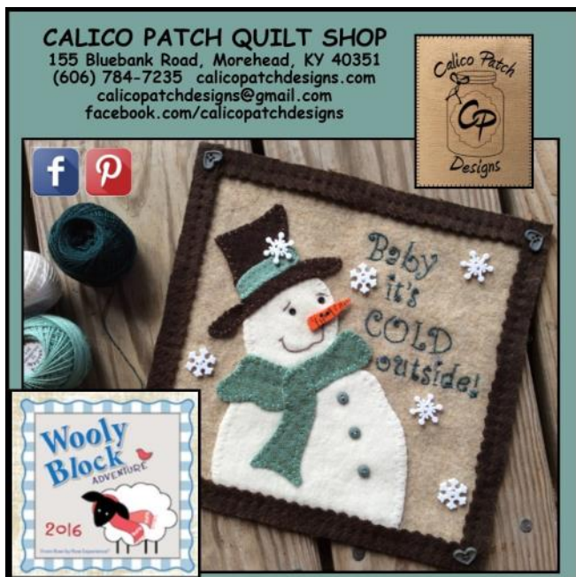
2016's Woolly Block