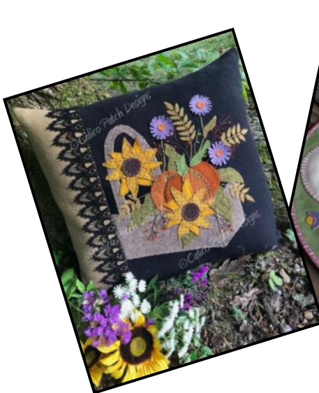
Autumn Wool Basket