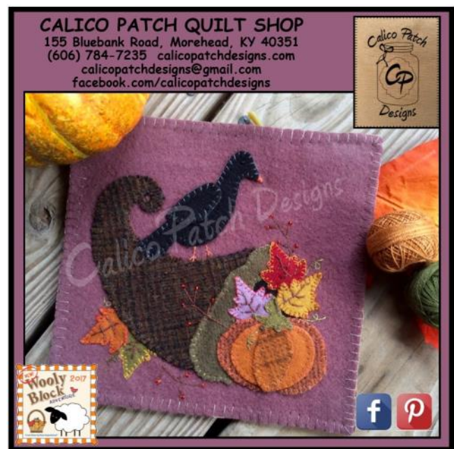
2017's Woolly Block