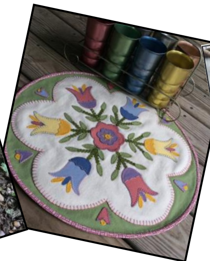
Wool Tulip Wreath