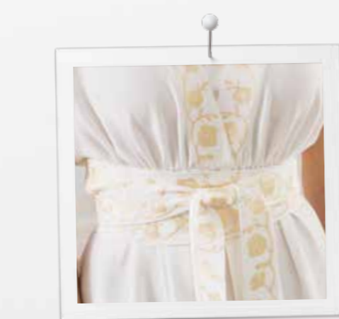
Automatic embroidery hoop recognition Automatic recognition of the hoop and stitch out area

The Embroidery Consultant and built-in tutorials offer direct on-screen support and answers to your questions whenever you need them.