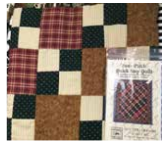
Quick Step (Four Patch)