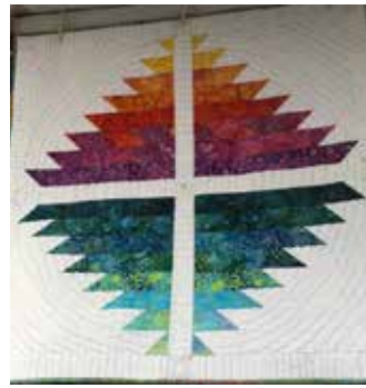
The Lost City