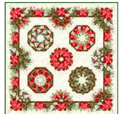
Stack & Whack with Borders