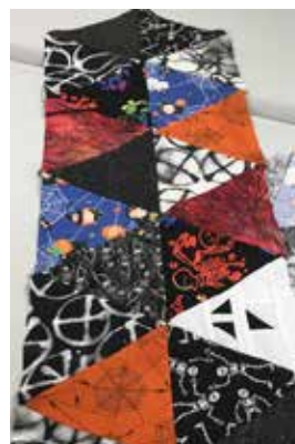
Halloween Table Runner