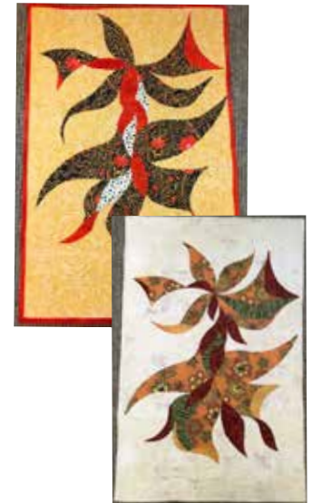
Easy, Breezy Flower