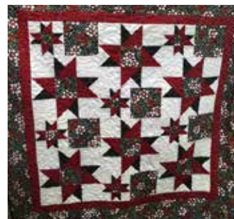
Stars for All Seasons