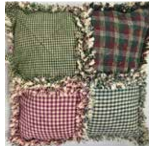
Rag Quilt Pillow