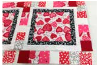
Huggable Table Topper (January 12; January 19)