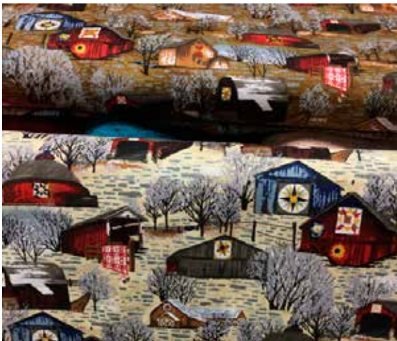
Quilt blocks on barns