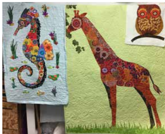
Artistic Animal Collage (February 4)