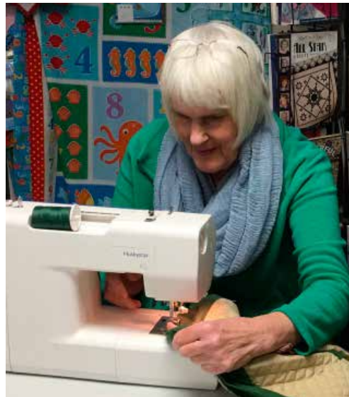
Private quilting lessons are available at the shop. Call for details