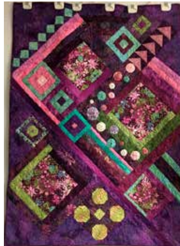
Blocks without Bounds (Starts February 11)