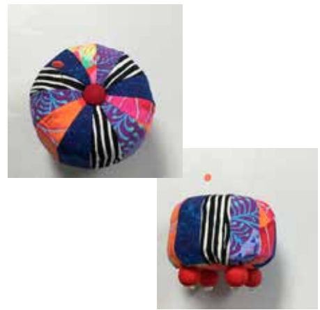
This is a kit. Shop sample on the right. Classes offered. See schedule on page 6.