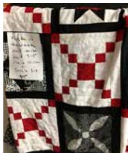
Block of the Week (Starts January 6)