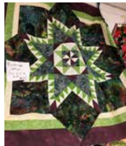
Feathered Star (January 3, 17, 31)