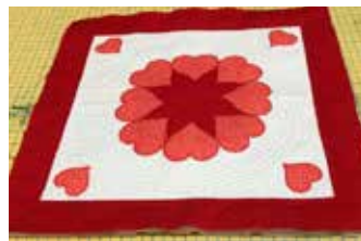
Mini Heart Wallhanging (January 26)