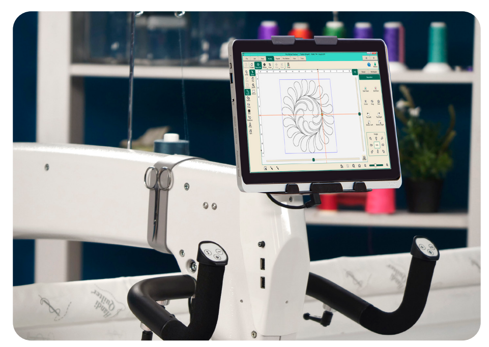
Pro-Stitcher Premium shown on one of many compatible machines.