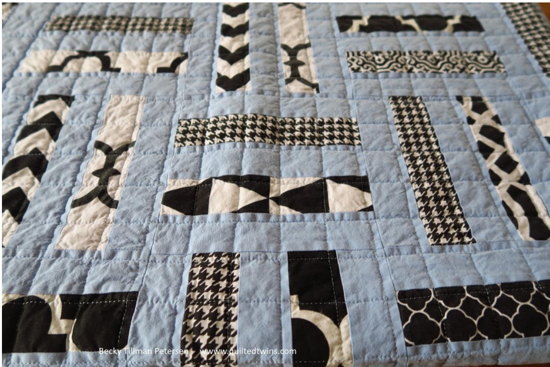
Photo of finished quilt