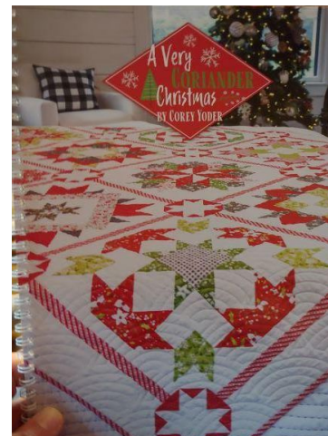
A Very Coriander Christmas Virtual Block of Month.

! Finished size: 66" x 72" PROGRAM STARTS January 18, 2021 and