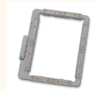
7" x 12" MAGNETIC FRAME SAMF300