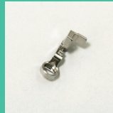
LOW SHANK RULER FOOT SA219