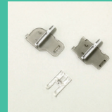
SPANISH HEMSTITCH FOOT SA220