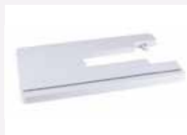
WIDE TABLE SAWTNQ1C (suitable with NQ700)