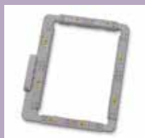
7"X12" MAGNETIC FRAME SAMF300