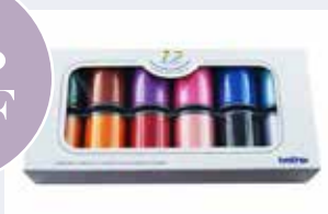
12-COLOUR EMBROIDERY THREAD SET SAETTS