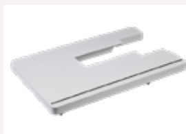
WIDE TABLE SAWXP1C