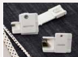
BIAS TAPE BINDING SET SA230CV (suitable with CV3550)