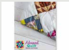
ADVANCED QUILT DESIGN SOFTWARE SAADVQLT