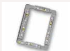
MAGNETIC FRAME 4"X7" SAMF180N