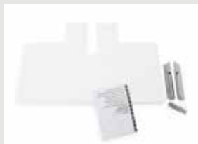
WIDE TABLE PR1XWT1