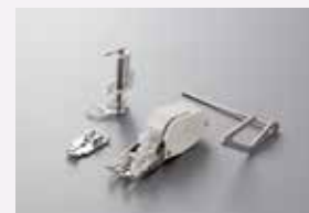
QUILT SET SAQKIT (suitable with ND50E)