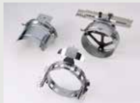
CAP FRAME AND DRIVER SET PRCF3