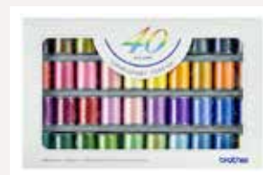
40-COLOUR EMBROIDERY THREAD SET SA740