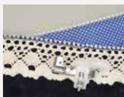
SERGER ELASTIC APPLICATION FOOT SA217 (suitable with AIRFLOW 3000)