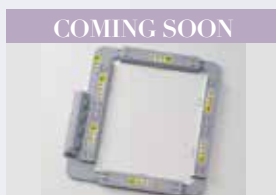
4"X4" MAGNETIC FRAME SAMFM100 (suitable with NS1850D and SE750)