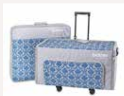
LUMINAIRE ROLLER BAG SET SASEBXP1