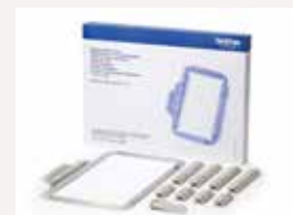
MAGNETIC SASH FRAME SAMS360