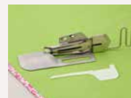
DUAL FUNCTION FOLD BINDER SA231CV (suitable with CV3550)