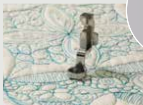
HIGH SHANK RULER FOOT SA218 (suitable with BQ2500)