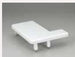
WIDE TABLE SAWT8 (suitable with AIRFLOW3000)