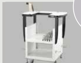
STAND FOR PR SERIES PRNSTD2