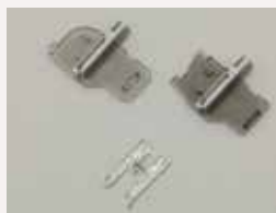
GATHERING FOOT SA220