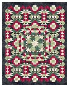
Shortcut Sheet Mosaic Technique of the Month

I have a brand new project to start in February.