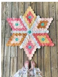
OH HONEY QUILT PATTERN

Do you have an interest in Hand Sewing? Does English Paper Piecing sound like something you'd like to try? Then this is the perfect class for you! This class will be teaching the table topper done by English Paper Piecing, but the pattern you will be using offers the opportunity to use regular piecing to expand it into this stunning quilt!