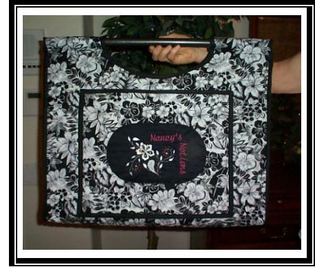
Quilters Large Tote