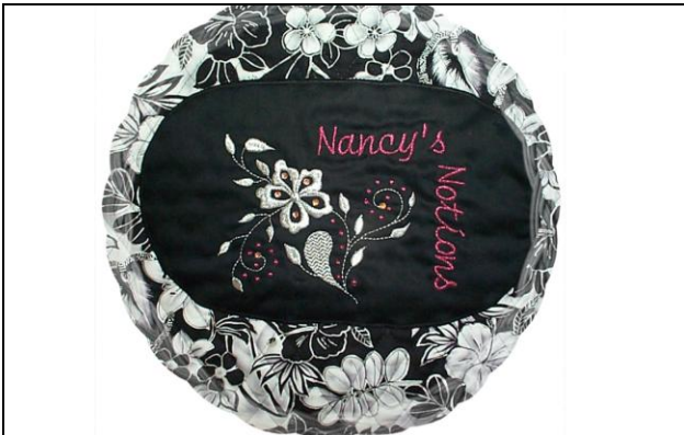
Your pocket design can finish as an oval shape or...

If you want to create a personal design that will be added as embellishment on the outside pocket, THIS MUST BE COMPLETED PRIOR TO CLASS . Sample personal designs are shown below.