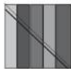
stitch & trim