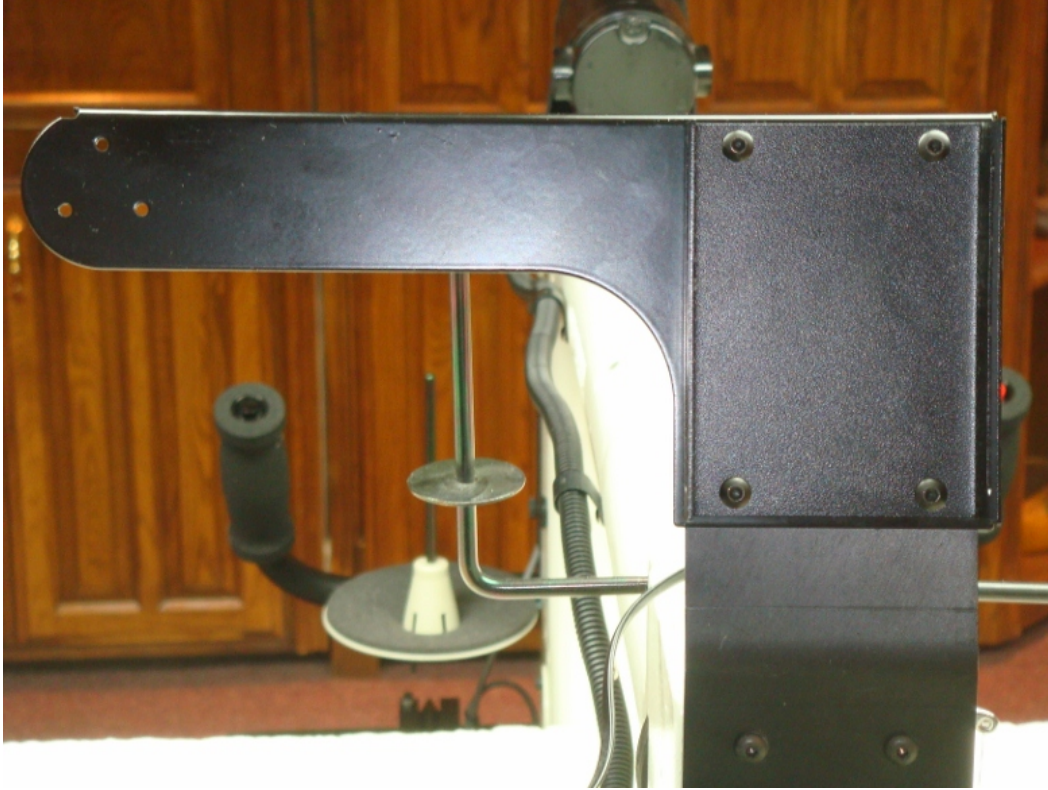
This is how the adapting bracket should look installed.

Now take the AQE supplied IQ adapting bracket and line up the holes/slots where you just removed the tablet holding bracket, bracket. The long thin portion of the adapting bracket should be on the left side. Re-install the four allen button head screws.