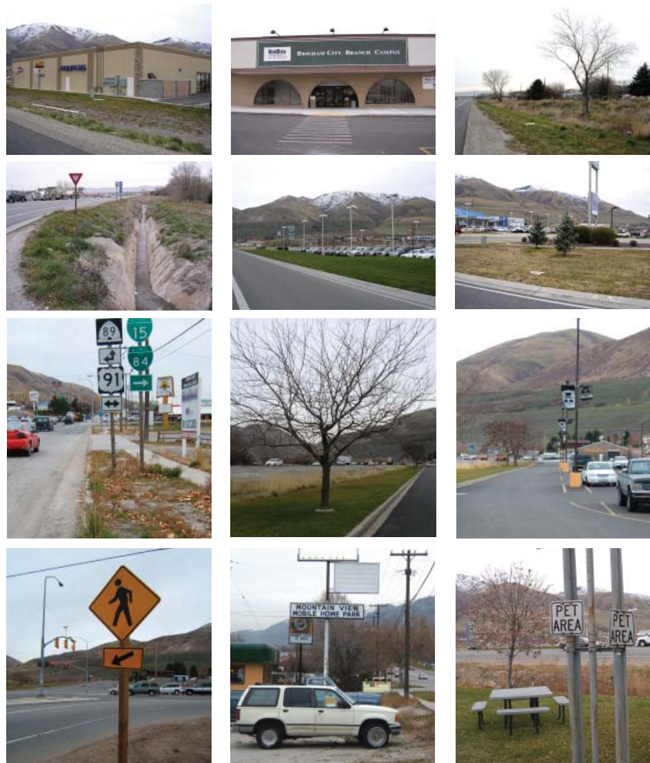
The 1100 South Corridor is characterized by large, auto-oriented retail and campus uses as well as open areas of landscape within the right-of-way.