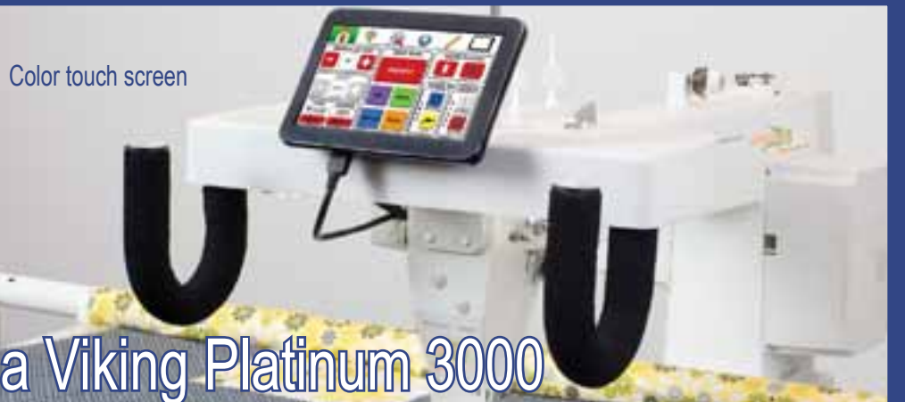
Husqvarna Viking Platinum 3000

The long-arm machines are here and demo ready!