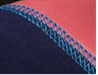
Use the back side of the triple coverstitch* as a beautiful decorative seam. Using rayon thread increases the effect. Try it for yourself!