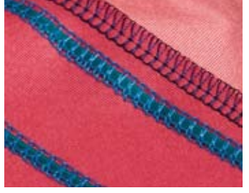
Stitch over silk ribbon with the flatlock stitch to create a delightful, raised seam. Different weights of thread result in different looks.