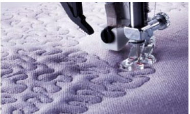
Free motion sewing – let your imagination run free.

All this and more are waiting for you. Visit your authorized PFAFF® dealer and test drive the PFAFF® ambition™ line sewing machines for yourself.