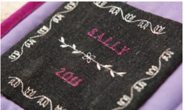
Mirror, combine and save stitches and create your own design highlights. Up to 4 alphabets. Choose from different styles.

The difference is in the details! Sophisticated statement for your living room.