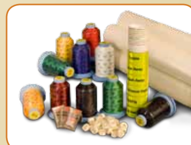
Embroidery Essentials Kit