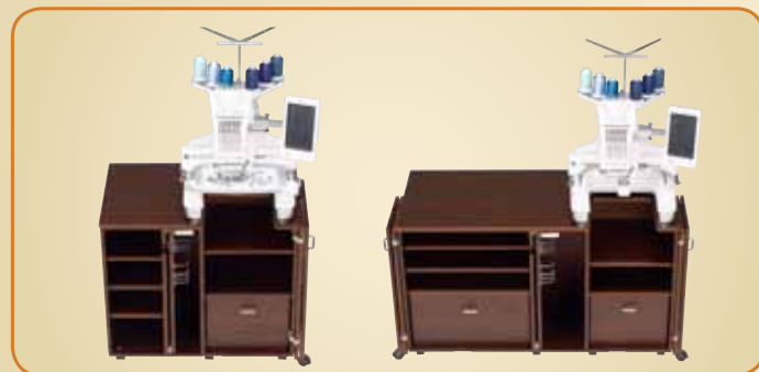
Embroidery Center Plus and Embroidery Center Pro Plus Koala Studios