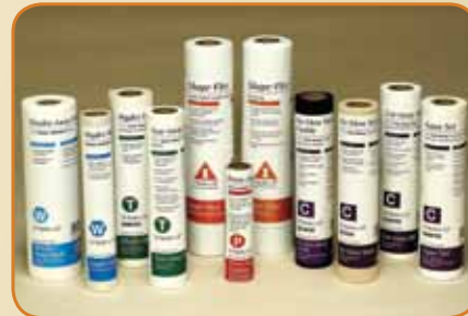
Baby Lock Stabilizer