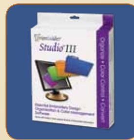
Studio III Cataloging Software