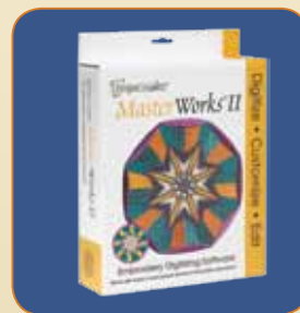
MasterWorks II Digitizing Software