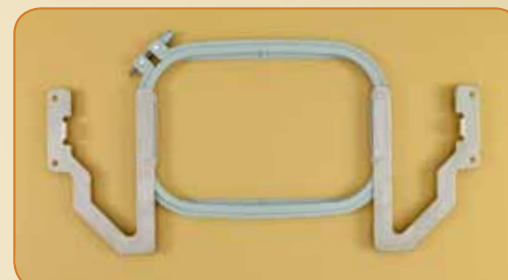
Tote Bag and Purse Hoops