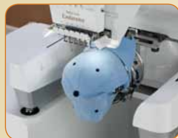
Advanced Cap Frame Set

Get the most out of your Baby Lock Endurance with performance enhancing accessories. There are numerous specialty hoops such as tote bag and purse hoops, which makes it easier to hoop projects. The Embroidery Center Plus and Embroidery Center Pro Plus from Koala Studios would also improve your embroidery experience by properly displaying your machine and providing plenty of storage for fabric and notions. Also don't forget to ask your Baby Lock Retailer about the Gold Standard three-year comprehensive care program!