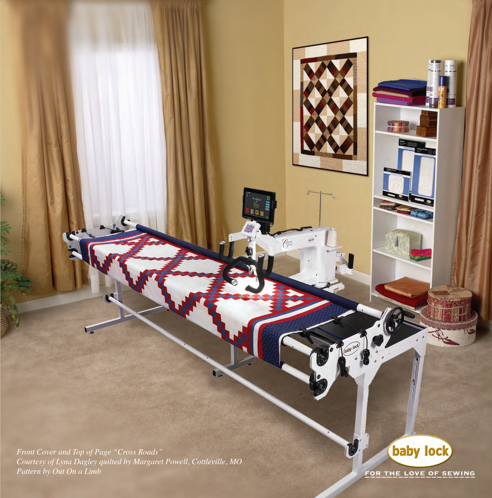
Front Cover and Top of Page “Cross Roads” Courtesy of Lyna Dagley quilted by Margaret Powell, Cottleville, MO Pattern by Out On a Limb

Enjoy less bobbin changes with the largest bobbins available in quilting (up to 40% more than a standard bobbin). Quilting is also more convenient with the high-speed rotary hook and a separate electric bobbin winder with variable speeds.