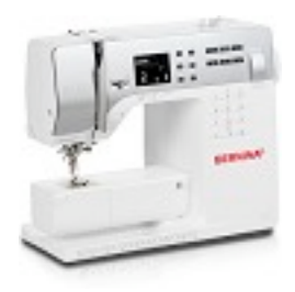
...a Bernina for every skill level!