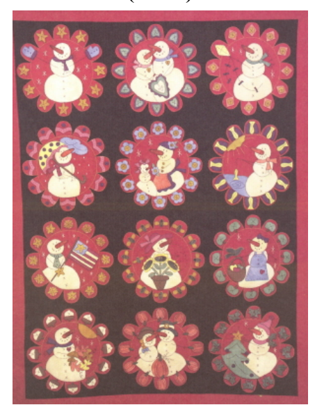
Snowpennies 60" x 78" Begins February 15, 2012 6 month BOM

Snowpennies is a 6 month program. You will receive 2 blocks per month.