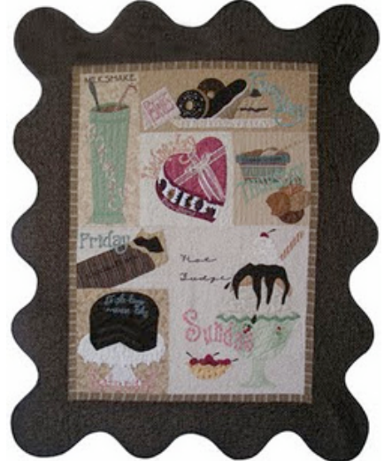
Let There Be Chocolate! 46"x56" Begins February 15, 2012 8 month BOM

A sweet, yummy quilt to celebrate chocolate for every day of the week! Seven blocks depict a different treat each day, and the eighth and final pattern details how to sew them all together and add the borders. Fabrics may not be identical to the sample.