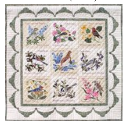
Forget~Me~Not 50" x 50" Begins February 15, 2012 FUSIBLE WEB II 10 month BOM

This is a 10 month BOM. Sign up early~limited number of kits!