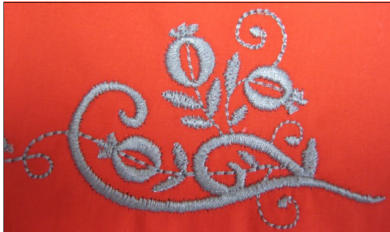
Original 100% Density