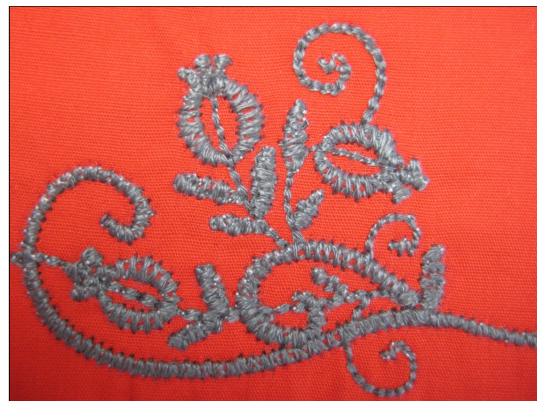
30% Density, Size 16 Perle Cotton