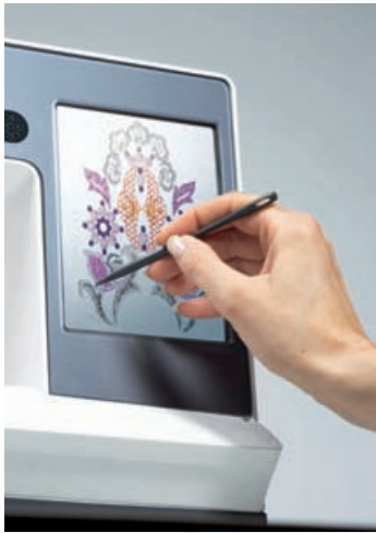
Combine, change, and vary embroidery designs and decorative stitches as desired. Use creative possibilities to full potential.

The Pfaff creative vision™ is a dream come true. It's wide range of possibilities and the unlimited selection of stitches, techniques and designs are impressive. Every stitch is absolutely beautiful.