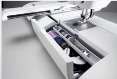
Large accessory tray in the embroidery unit!

The heart of the creative vision™ is the large touchscreen with its high resolution, an absolutely realistic 3D representation of your embroidery design in its true colors, and an intuitive graphic interface – clear, well structured, and easy to understand. You'll love it! All embroidery designs can be customized directly on the touchscreen. Elements can be moved and combined, enlarged or reduced – as the mood and the inspiration strike you – to create embroidery designs which are uniquely yours. The results will amaze you! You can easily select the desired function with the ergonomic stylus.