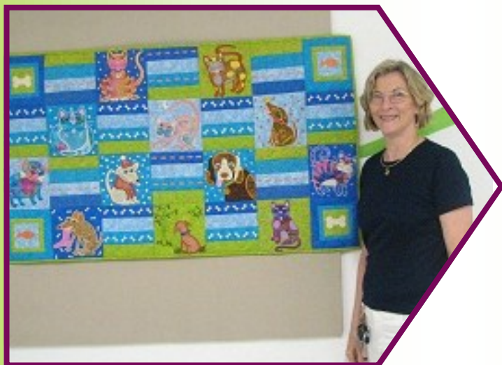
Anita Goodesign Dogs & Cats