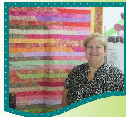
Jelly Roll Winner

Just a few of our customer family's creative accomplishments!