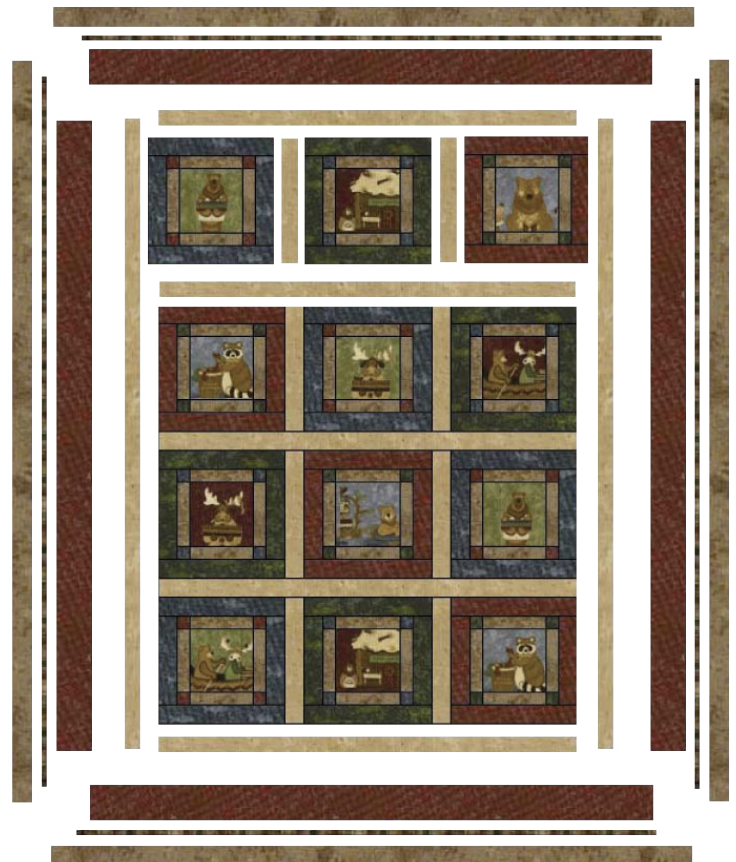
Quilt Top Piecing Diagram

www.thewoodenbear.com and check out our FREE DOWNLOADS!