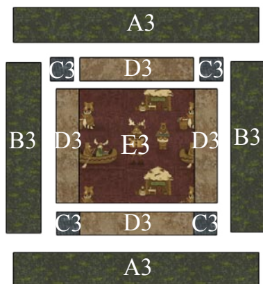
Block 3 Make 4